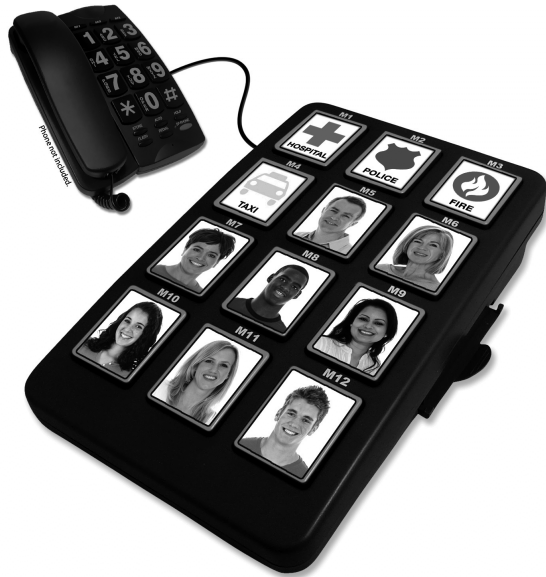
ITGS-450 Photo Dialer Manual